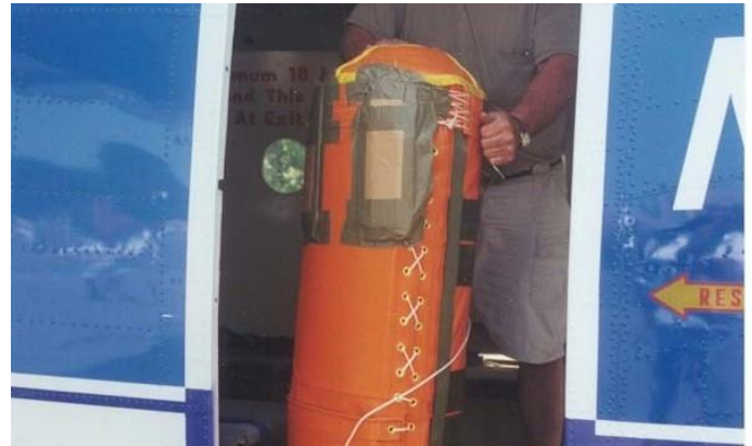
Survival Kits, Signaling Equipment, & Medical Equipment

Provides air-drop support to special operation teams and ground units conducting covert operations in forward areas. Weapons, Ammunition, Spare Parts, MRE's.